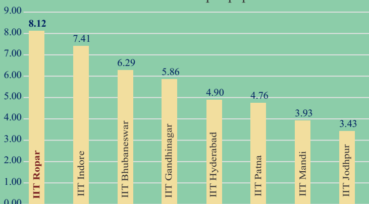
Citations per paper

IIT Ropar continues to lead the second generation IITs in research impact with an average citation of 8.12.