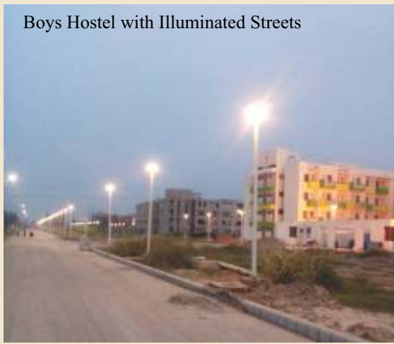
Boys Hostel with Illuminated Streets